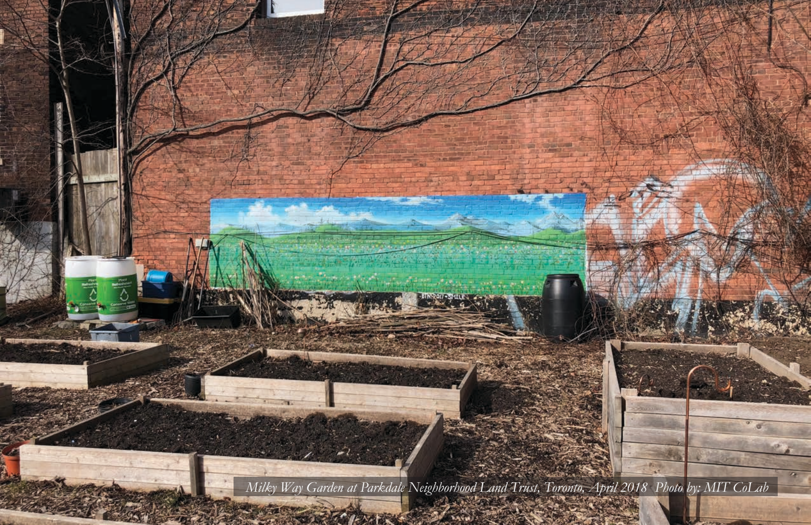
Milky Way Garden at Parkdale Neighborhood Land Trust, Toronto, April 2018