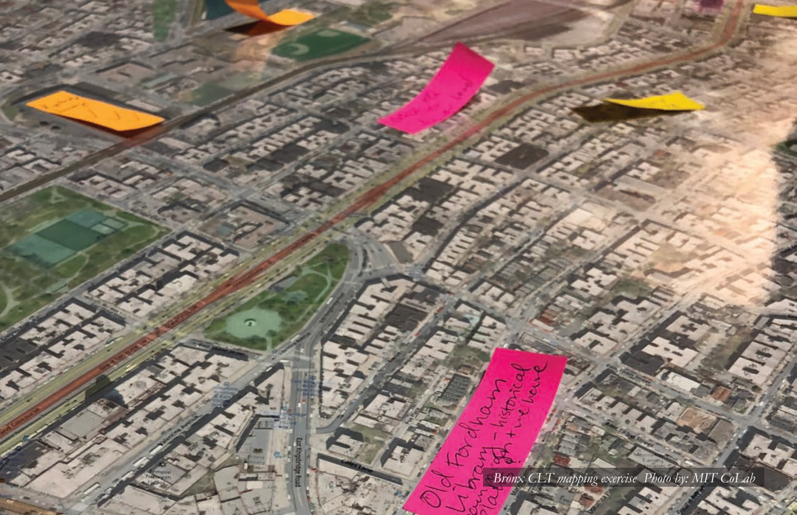
Bronx CLT mapping exercise