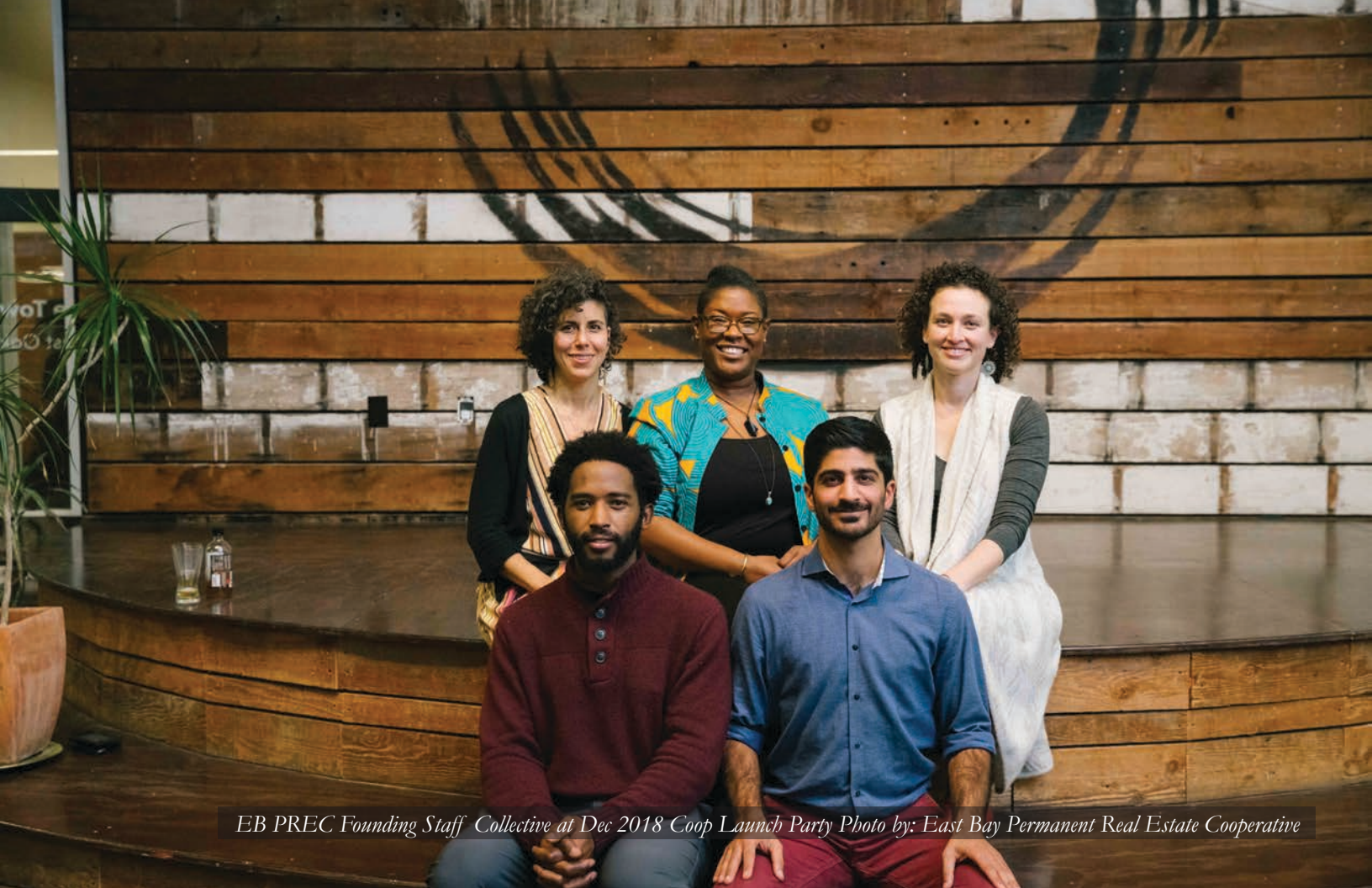
EB PREC Founding Staff Collective at Dec 2018 Coop Launch Party