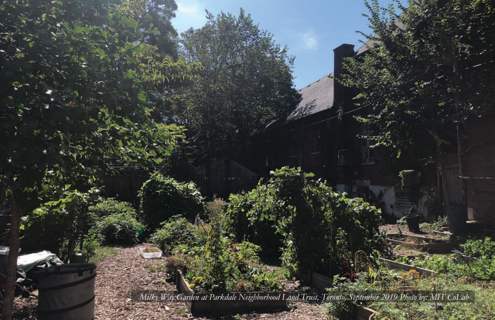
Milky Way Garden at Parkdale Neighborhood Land Trust, Toronto, September 2019