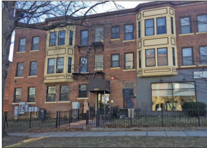
Tenant-owned cooperative with affordable housing units in Washington, DC.

In spite of the strong legal guarantees for long-term affordability and public use of RAD properties, much of the criticism of the RAD program has emphasized the potential harms of