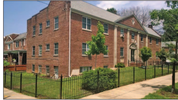
A building developed by the H Street Community Development Corporation, Washington, DC.

Rental Assistance, the National Housing Trust Fund, the HOME program, the Community Development Block Grant program, and the Rental Assistance Demonstration (the main public housing redevelopment program at HUD). We also point out that these programs are all subject to HUD’s “affirmatively furthering fair housing” mandate, which encompasses principles of both racial equity and racial integration.