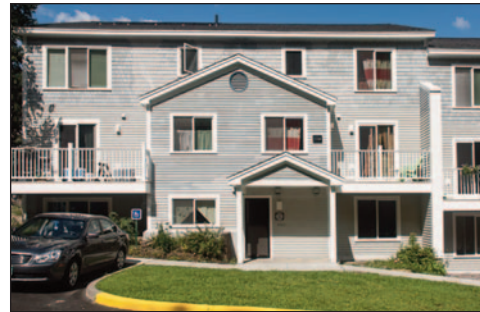
Burlington Land Trust rental housing, Vermont.