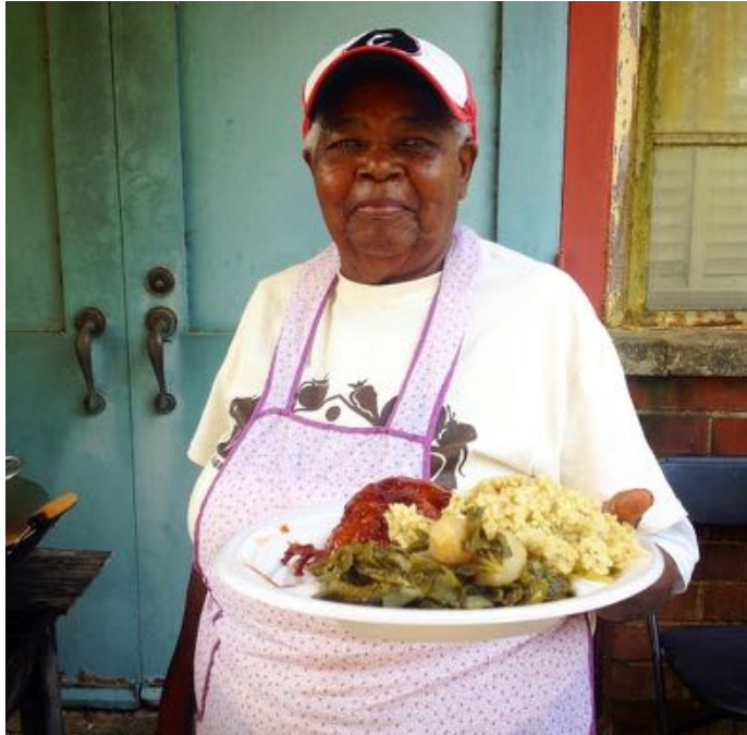
Soul Food With a Twist