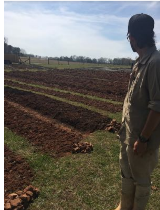
Feed the People Farm Visit